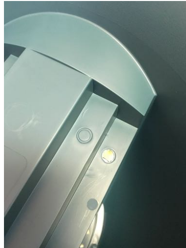
PUNCH THROUGH THE PUNCH HOLES.