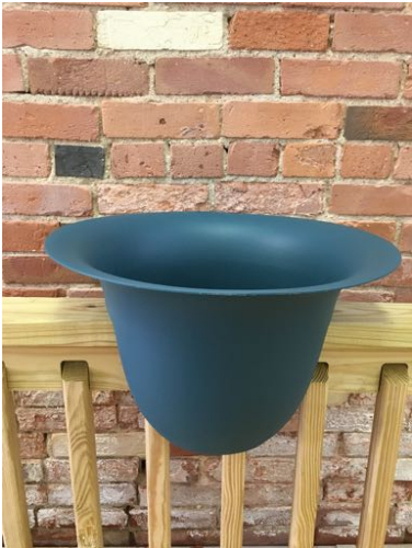
SET PLANTER ON RAILING.

[ MEASURE WIDTH OF RAILING, AND OBTAIN ZIP TIES OF APPROPRIATE LENGTH. ]