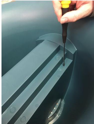
FIND A TOOL STRONG ENOUGH TO PUNCH THROUGH PLASTIC.

[ MEASURE WIDTH OF RAILING, AND OBTAIN ZIP TIES OF APPROPRIATE LENGTH. ]